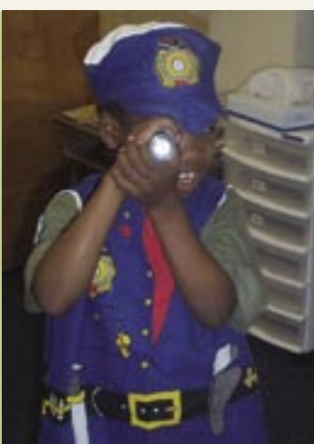
Young students learn that community helpers are their friends.