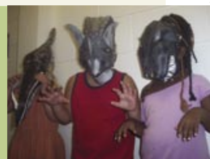
Students act out the book, The True Story of the Three Little Pigs .