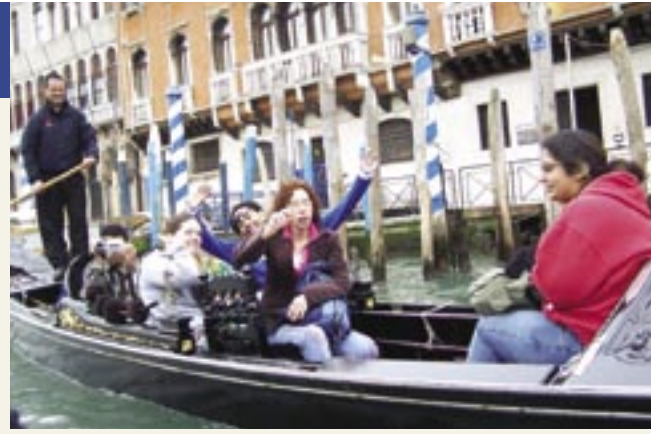
RSD students enjoy Venice.

One parent summed it up perfectly. "Travel does change lives...I think my son grew up a whole year in those 10 days."