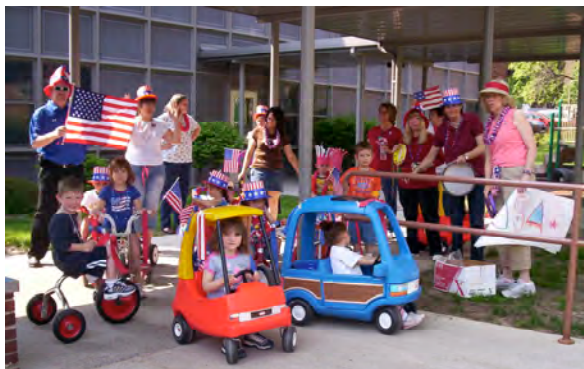
Memorial Day Parade