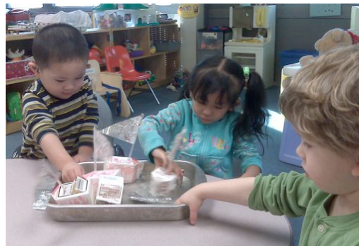
Science at it's best....