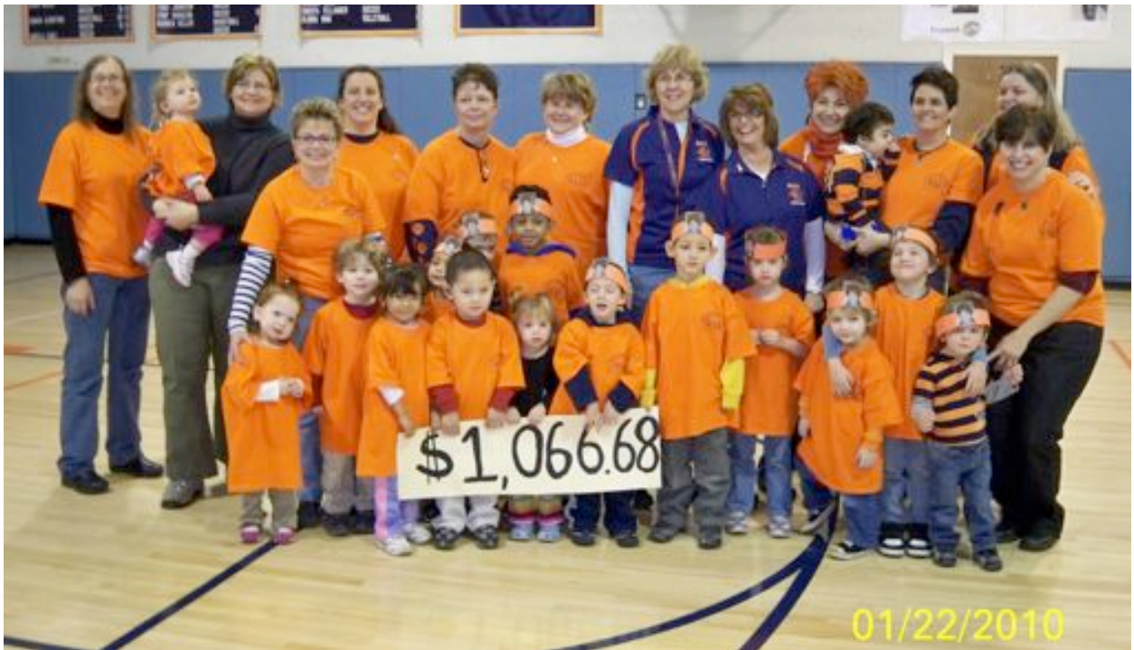
WOW...ECC raised $1, 066.68 !!!