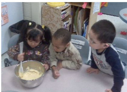
A Preschool cooking lesson.