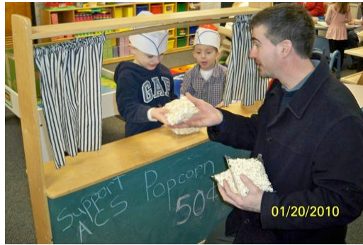
We had a popcorn sale to raise money for Coins for Cancer