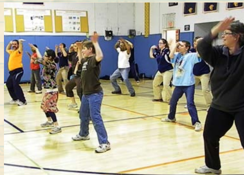
RSD Families ZUMBA at Family Fitness Night at RSD.