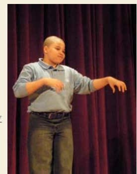
Clarence Market, 5th Grade